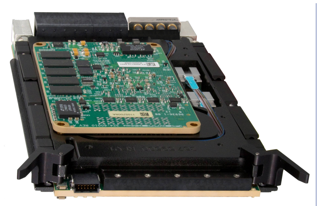
Figure 3. Pentek Quartz<sup>®</sup> Model 5550 3U VPX 8 Channel A/D and D/A RFSoC SOSA-Aligned Processor incorporates RF and optical backplane using VITA 66 or VITA 67 connectors. The top cover has been removed to show details.

scores for maintenance and reliability. Some of the latest modular backplane standards offer extremely high density and even mixed RF/optical interfaces as shown in Figure 2.