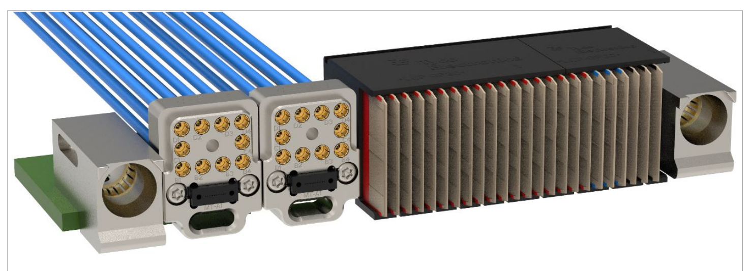
Figure 2. Rear view of 3U OpenVPX Module with two VITA 67.3D backplane connectors, each with 10 coaxial RF signals and 24 optical lanes.

Backplane I/O for RF signals and optical interfaces in OpenVPX have gained significant traction in CMOSS, MORA, and HOST systems over the last six years, all enabled by VITA 66 and VITA 67 specifications. Eliminating front panel cable harnesses wins high