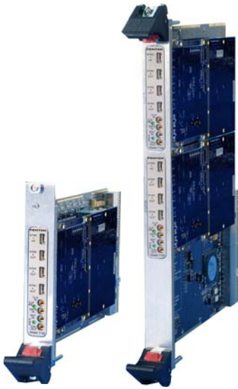
Model 7392 Model 7492