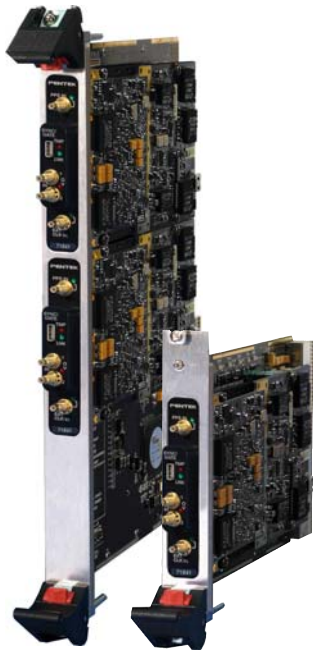
Model 74841 Model 73841