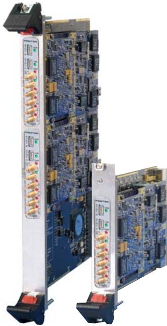
Model 74670 Model 73670