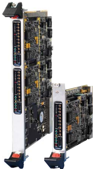
Model 74131 Model 73131