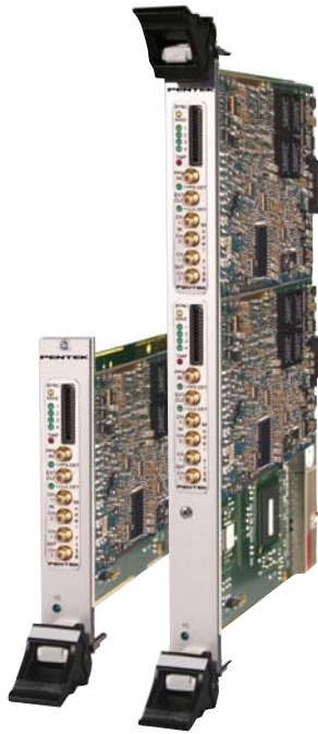
Model 7356 Model 7256D