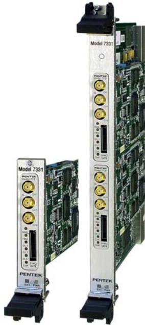
Model 7331 Model 7231D