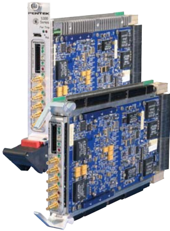
Model 53690 COTS (left) and rugged version