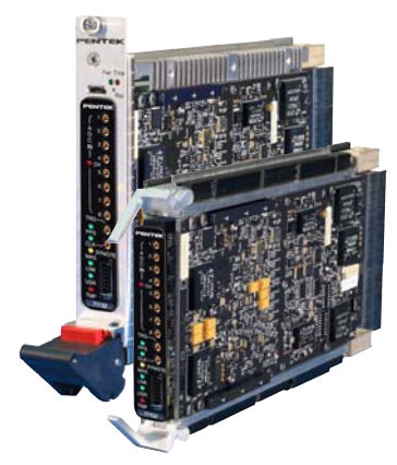
Model 53132 COTS (left) and rugged version