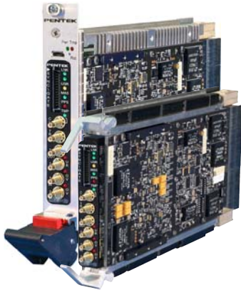
Model 52851 COTS (left) and rugged version