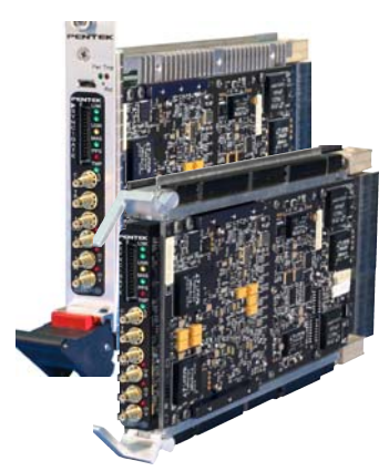
Model 52751 commercial (left) and rugged version