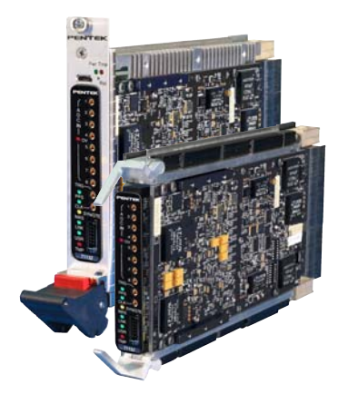
Model 52132 COTS (left) and rugged version