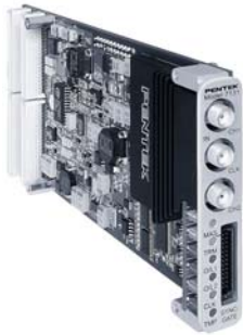
Pentek Model 7131 is a 16-channel digital receiver PMC module; it includes two A/Ds and a Virtex-II FPGA.

The PCI specification is inherently high performance allowing transfer rates of 132 Mbytes/sec in its 32-bit implementation. Options using the 64-bit version