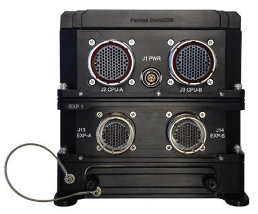
Curtiss-Wright Defense Solutions offers its DuraCOR 80-41 Intel Core i7 mission computer.

Kontron engineers customized the company's COTS Cobalt 901 to match Hughes DISD's SATCOM system requirements. Kontron's sealed and validated IP67 embedded computer system offered Hughes engineers a wide selection of processor, storage, power, and interface options, as well as a small terminal footprint optimized for performance, harsh environments, and reduced SWaP - top priorities for Hughes to meet end user requirements.