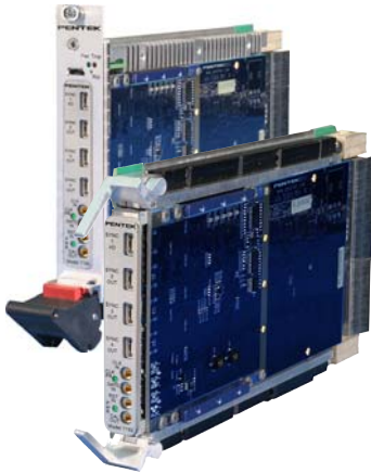
Model 5292 COTS (left) and rugged version