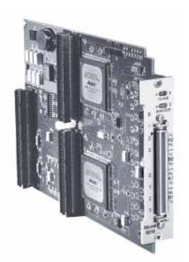
One VIM-2R plus one VIM-2 module may be attached to a 4290 or 4291 processor boards.