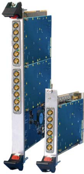
Model 7494 Model 7394