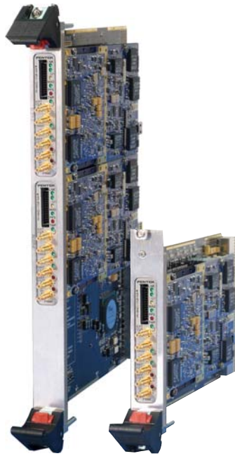
Model 74690 Model 73690