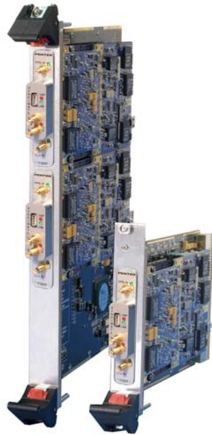
Model 74641 Model 73641