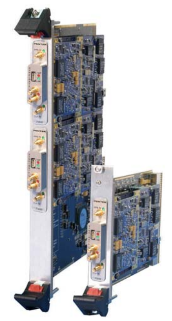
Model 74640 Model 73640

Option -104 provides 20 LVDS pairs between the FPGA and the J2 connector, Model 73640; J3 connector, Model 72640; J3 and J5 connectors, Model 74640.