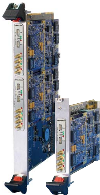
Model 74630 Model 73630