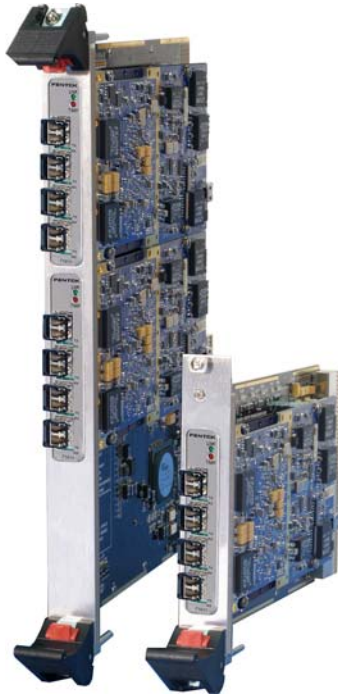
Model 74611 Model 73611