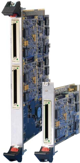
Model 74610 Model 73610