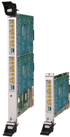
Model 7420 Model 7320