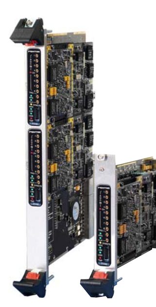
Model 74132 Model 73132