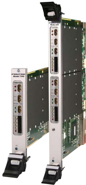
Model 7340 Model 7240D