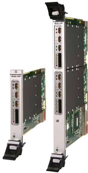
Model 7340-430 Model 7240D-430