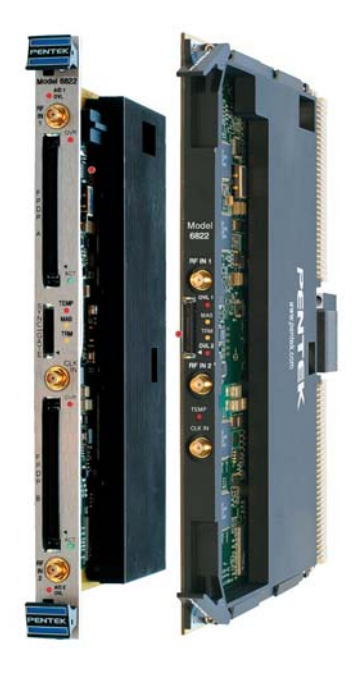
Model 6822 standard single slot (left) and conduction-cooled version.