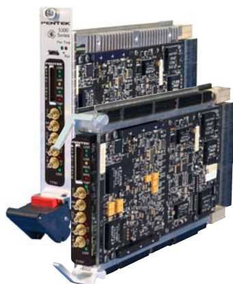
Model 53791 COTS (left) and rugged version