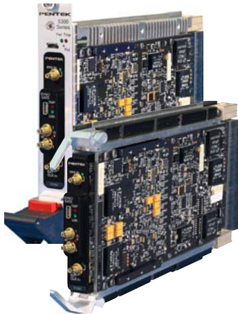
Model 53741 COTS (left) and rugged version