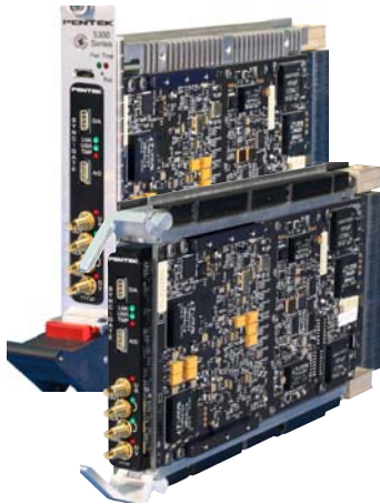
Model 53730 COTS (left) and rugged version