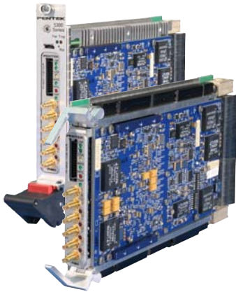
Model 53663 Commercial (left) and rugged version