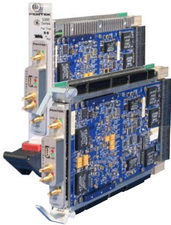
Model 53641 COTS (left) and rugged version