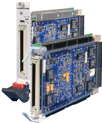
Model 52610 COTS (left) and rugged version