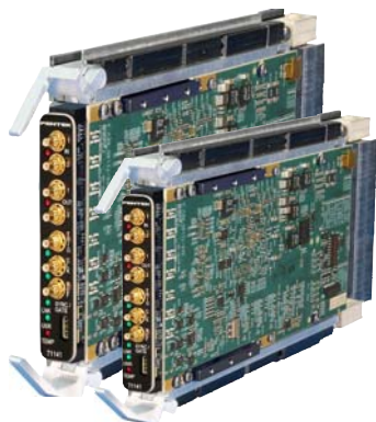
Model 53141CORs (left) and Rugged versions