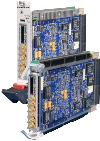
Model 52651 COTS (left) and rugged version