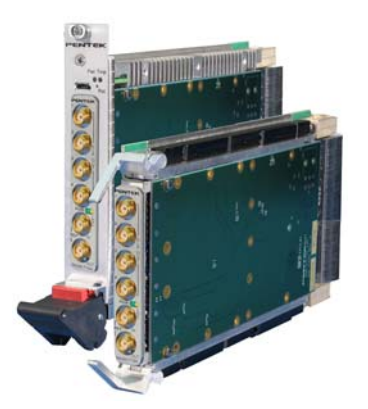
Model 5294 COTS (left) and rugged version