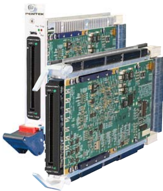
Model 5280 COTS (left) and rugged version